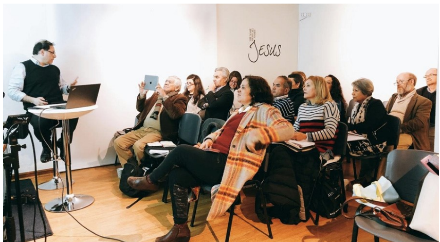
The new ELIM Bible school